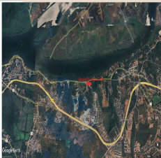
* DISTANCE CHART*