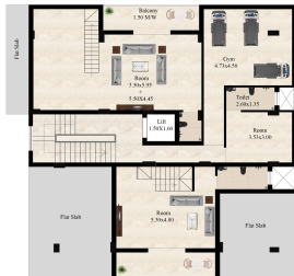
ATTIC FLOOR PLAN