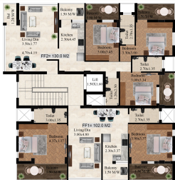
TYPICAL UPPER GROUND, FIRST, SECOND, THIRD FLOOR PLAN