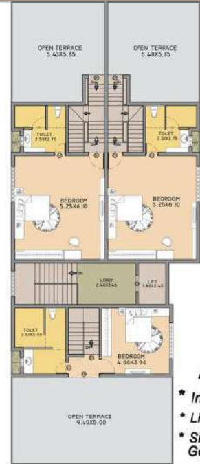
ATTIC FLOOR PLAN